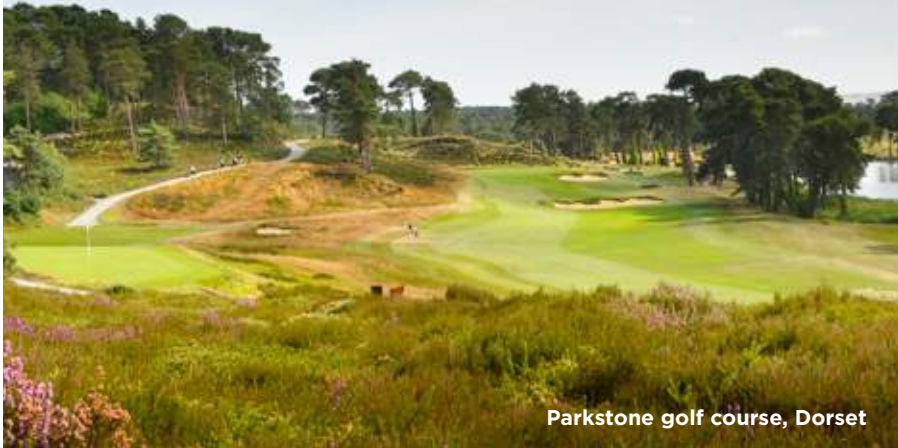
Parkstone golf course, Dorset

England Golf will host one of the top events in women's amateur golf when it stages the 2019 European ladies' championship at Parkstone Golf Club in Dorset.