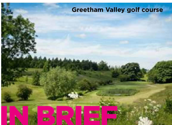
Greetham Valley golf course